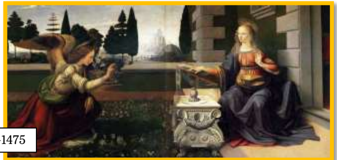
The Annunciation , Leonardo da Vinci, 1472-1475