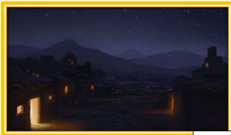
Rural Bethlehem at night