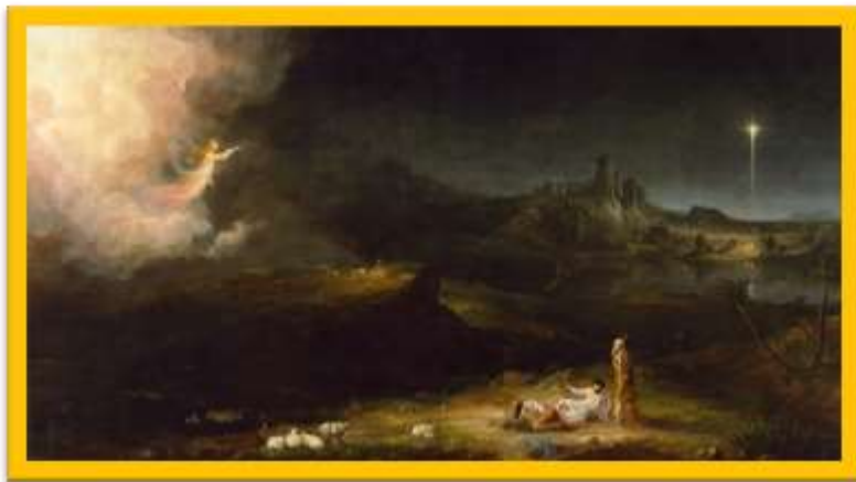
The Angel Appearing to the Shepherds, Thomas Cole, 1883-1884

8 And in the same region there were shepherds out in the field, keeping watch over their flock by night. 9 And an angel of the Lord appeared to them, and the glory of the Lord shone around them, and they were filled with fear. 10 And the angel said to them, "Fear not, for behold, I bring you good news of a